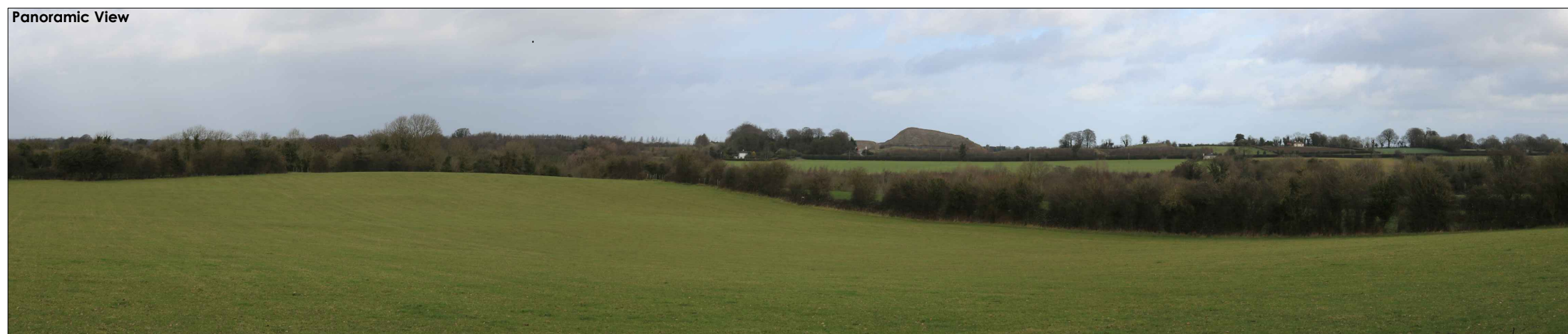
Viewpoint 8 North from L80142. View South from minor road L80142 approx 1km from the subject site. From this section of road the existing temporary overburden is clearly visible, however areas of proposed extraction would not be visible due to a combination of intervening vegetation and topography.